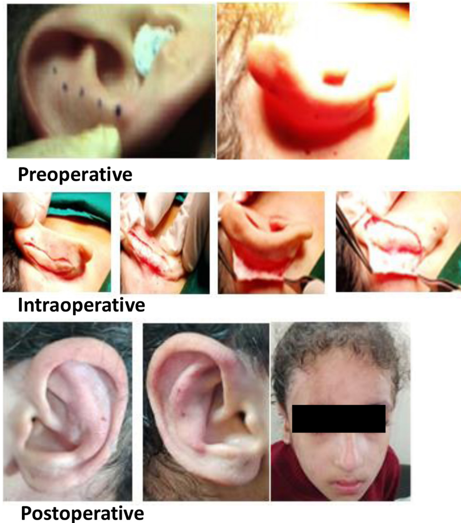
Figure 3 Case 3 in details.

surgery done with the Stenstrom technique and revealed that 89% of the patients were satisfied with the results. Heftner also stated that in 81% of the patients the Stenstrom technique had resulted in rounded and acceptable antihelical folds. In the 12-month follow-up period, Calder and Naasan 24 observed a 16.6% complication rate (infection, keloid development, hemorrhage, and anterior skin necrosis) and 8% recurrence rate.