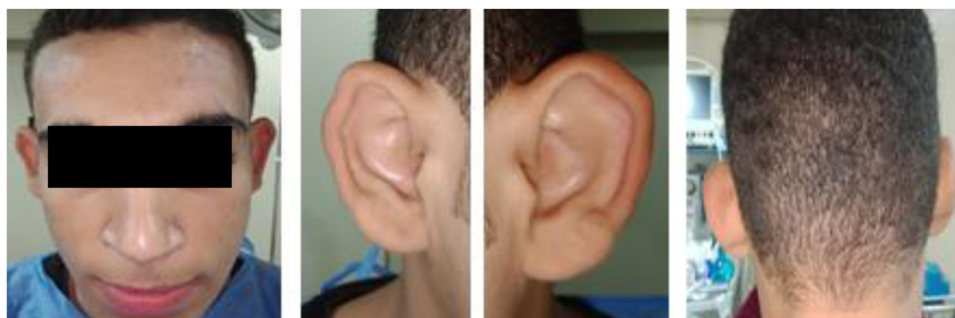
Preoperative frontal, side and back views