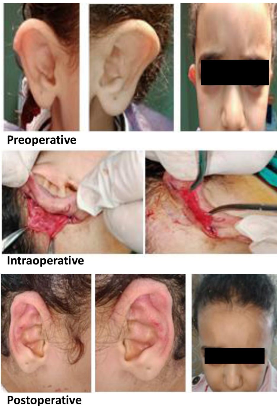
Figure 2 Case 2 in details.

ears that were operated with Mustardé method were reoperated twice more than the other method (24.4% compared with 9.9%). Tan has revealed that sinus formation and wound infection caused by suture extrusion were seen in 15% of the patients. Mustarde has published 2 studies. First, published in 1967, had 264 ears he had operated in a period of 10 years. 19 17 patients had been not satisfied because of irregularities in the antihelix, sutures cutting through the cartilage, sinus formation, recurrence of the prominent ear deformity, and the increase in projection of lobule. In 1980, in the second study which done on 600 ears in 20-years