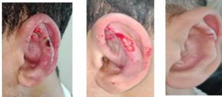
Skin necrotic patch