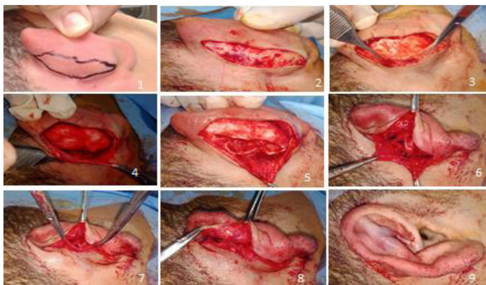
Intra operative steps